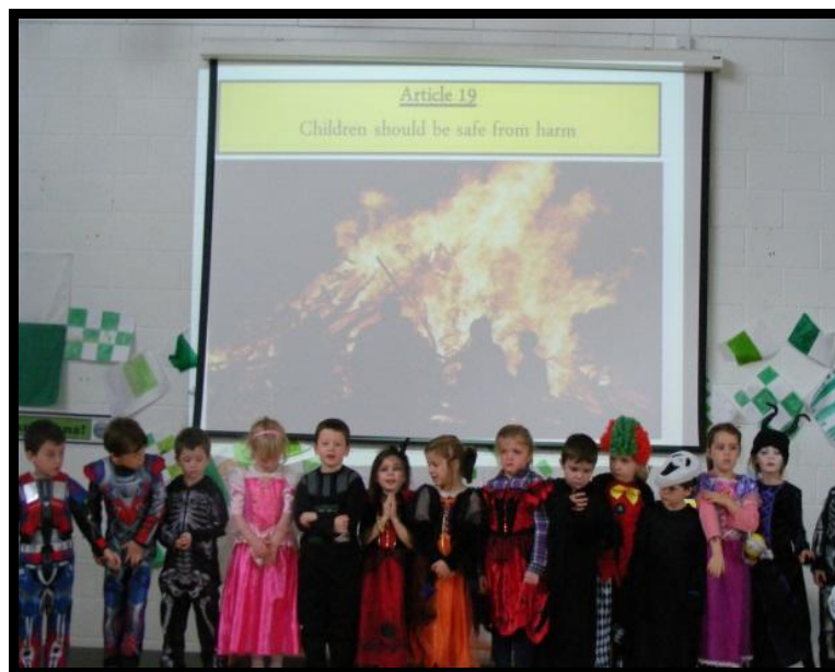
Primary 2 highlight the need for safety at Halloween