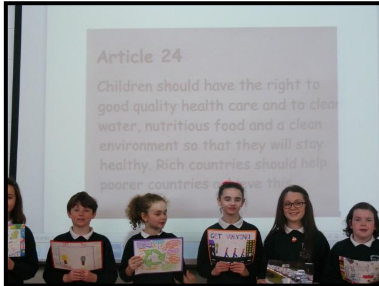
Carrick Council share an assembly on the work of Trocaire